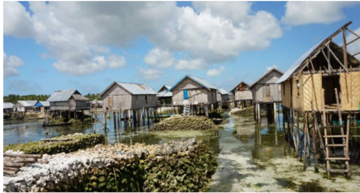
Figure 3. Bajo Community Settlements

The main occupations of the Bajo Community are fishermen and sailors. They are classified as tenacious workers and market their catch through capital collectors. The sea is the mainstay for their life. They control the life and intricacies of the sea (Samudin et al., 2019). That is one of the reasons why they protect nature, especially the sea.