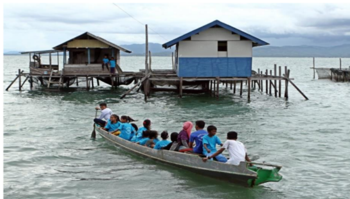
Figure 2. Bajo Community Houses

The Bajo people are often referred to as sea gypsies or sea nomads (Lowe, 2003; Hafid, 2003). Regarding their origin, there is a lot of information, some say that their homeland is from the Sulu Archipelago, South Philippines because there are similarities between their language and Tagalog. In Indonesia, the Bajo ethnics are scattered in various provinces in Sulawesi, including in South Sulawesi.